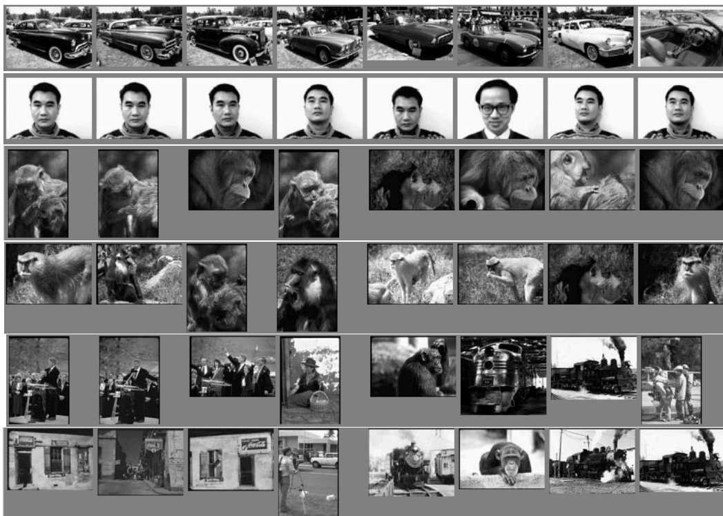
Figure 2: Image retrieval using Curvature and Phase

(also had Coca Cola logos) were retrieved (100% precision), two other very dissimilar images with coca-cola logos were not.