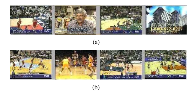
Fig. 2. First 4 ranked results for the query "Basketball".

Table 3 compares the performance of CRM and normalized CRM for three sets of queries. We observe that the latter method outperforms the former substantially, by 15%, 37% and 33% on the 1-, 2- and 3-words query sets respectively. For all three query sets the differences in precision are statistically significant at the 1% level according to the sign test. The precision at 5 retrieved key frames also indicates that using the latter method, there are half images relevant to the query in the top 5. We observe that normalized CRM consistently outperforms CRM over all query sets.