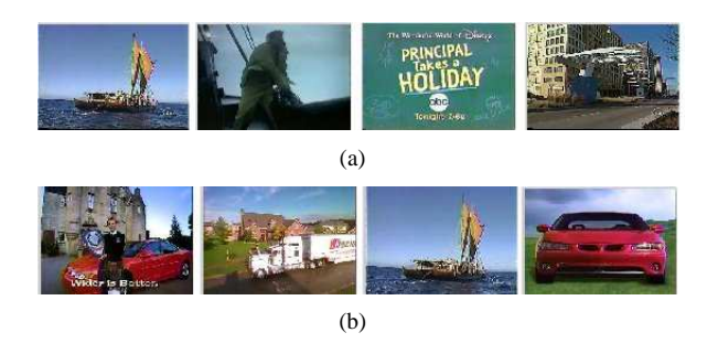
Fig. 3 . First 4 ranked results for the query "Outdoors, Sky, Transportation".

Figures 2 and 3 show the top 4 images in rank order using both CRM and normalized CRM corresponding to the text queries "basketball" and "outdoors sky transportation" respectively. We see that normalized CRM does much better than CRM.