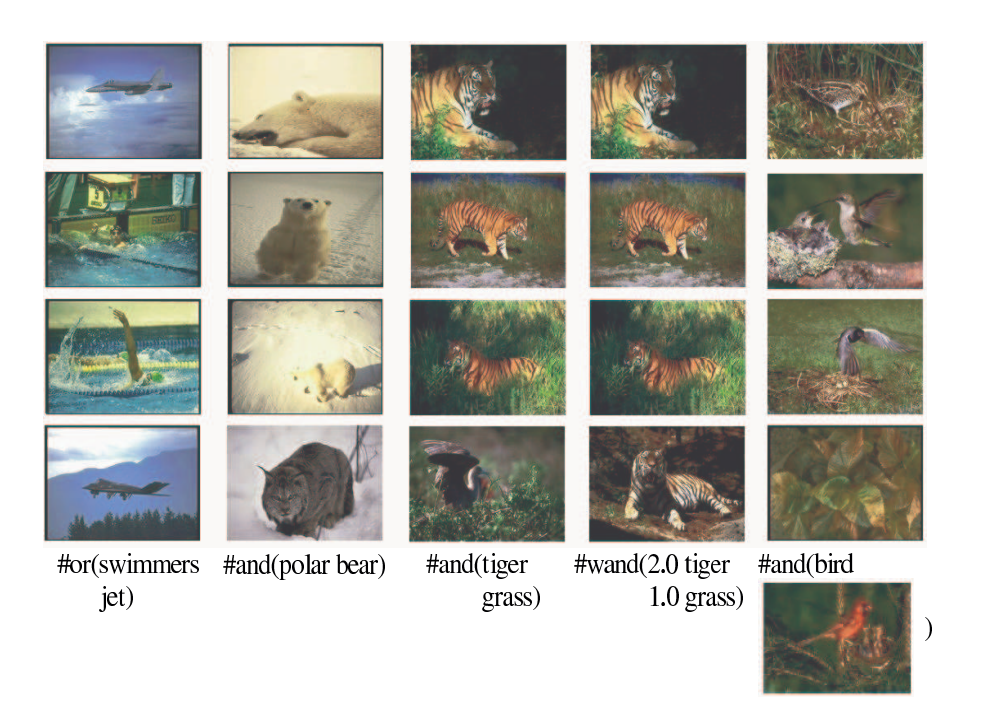
Fig. 2. Example structured query results